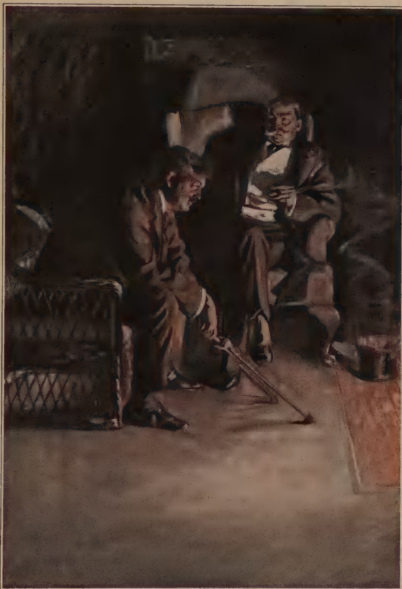
AROUND THE EMBERS OF THE DYING FIRE.